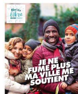
Campaign on social networks

Le Grand Est s'engage pour des Mairies libres sans tabac