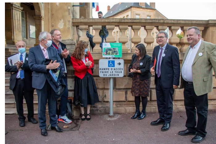
Thionville – 35 areas