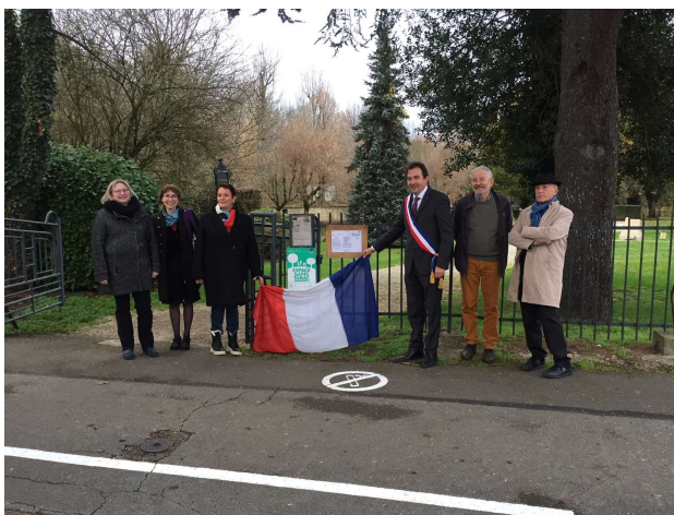
Joinville - 15 areas